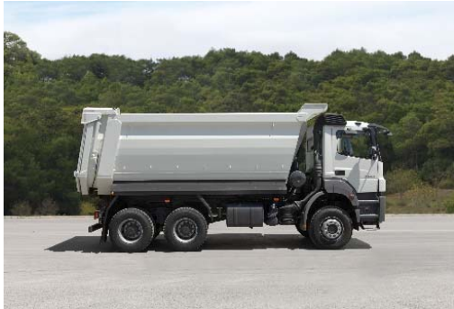
ROUNDED REAR TIPPER TRUCK MOUNTED