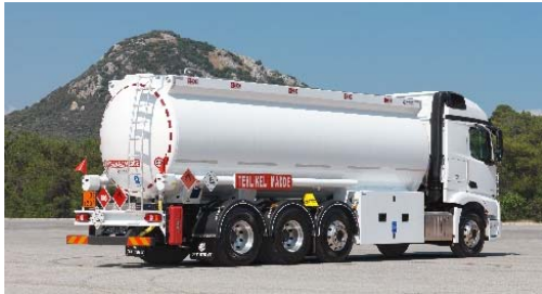
CYLINDRICAL TANKER TRUCK MOUNTED