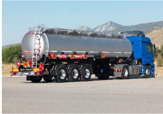
CHEMICAL TANKER SEMI TRAILER