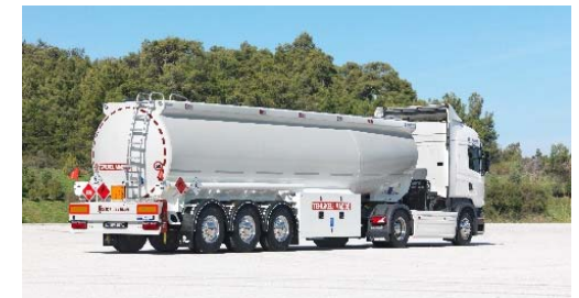
CONICAL TANKER SEMI TRAILER