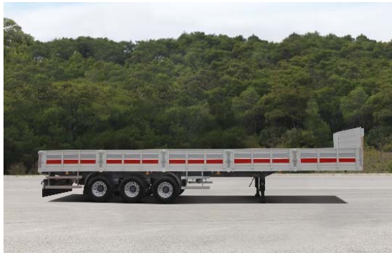
PLATFORM SEMI TRAILER