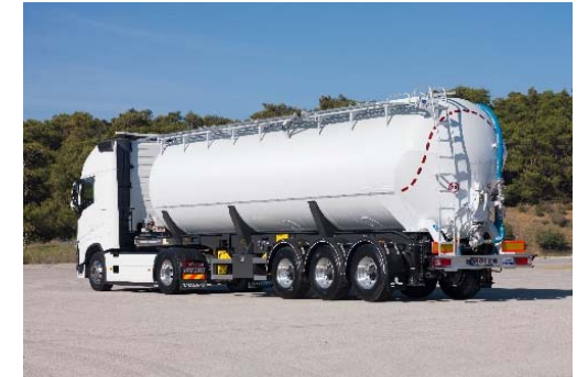
BULK FEED SILO SEMI TRAILER