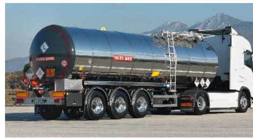
BITUMEN TANKER SEMI TRAILER