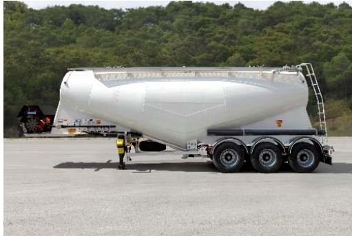
V TYPE NONTIPPING SILO SEMI TRAILER