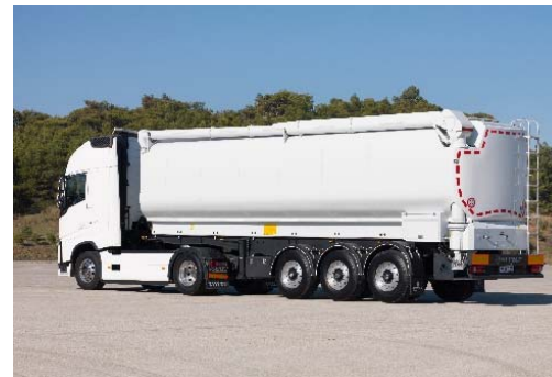
TIPPING SILO SEMI TRAILER