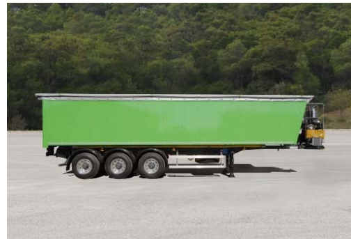
BOX BODIES REAR TIPPING SEMI TRAILER