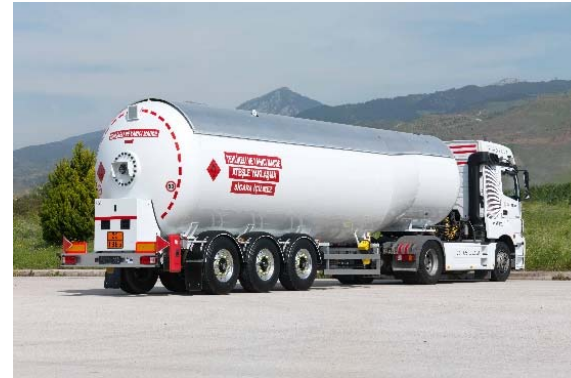
LPG TANKER SEMI TRAILER