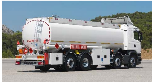
ELIPTICAL TANKER TRUCK MOUNTED