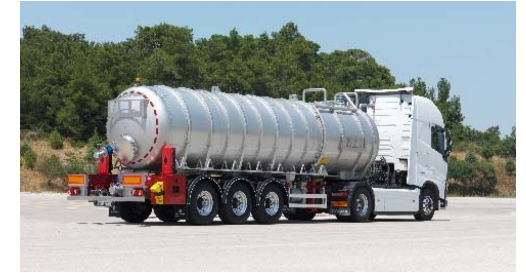
VACUUM TANKER SEMI TRAILER