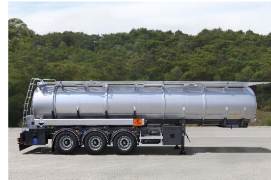
WATERTANKER SEMI TRAILER