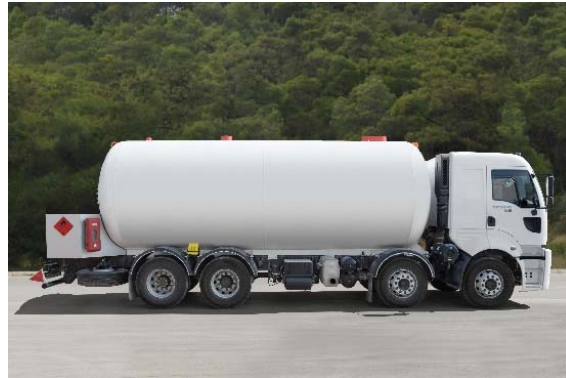
LPG TANKER TRUCK MOUNTED