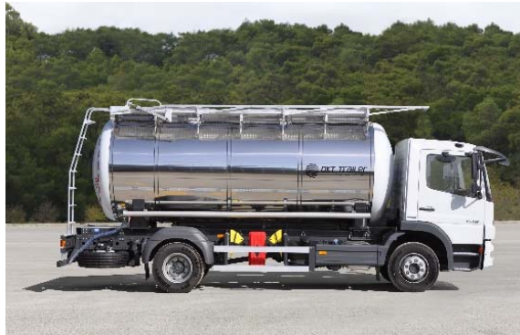
FOODSTUFF TANKER TRUCK MOUNTED