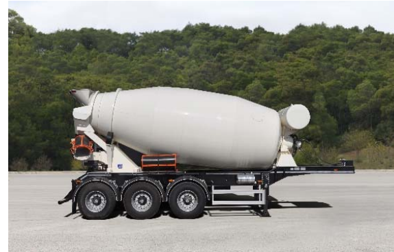
MIXER SEMI TRAILER