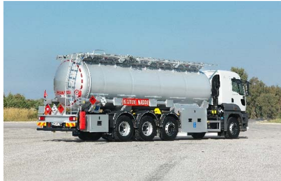
CHEMICAL TANKER TRUCK MOUNTED