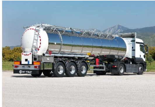
FOODSTUFF TANKER SEMI TRAILER