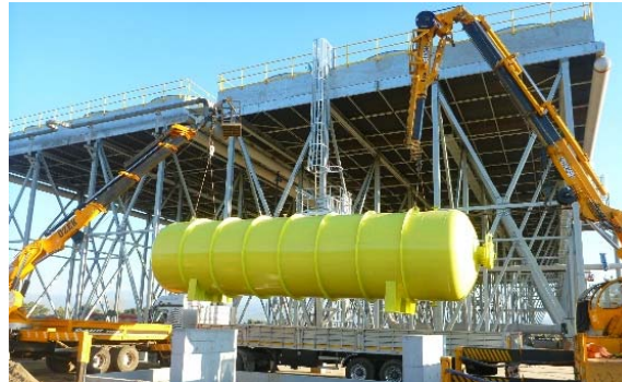
STOCK TANKS TANK