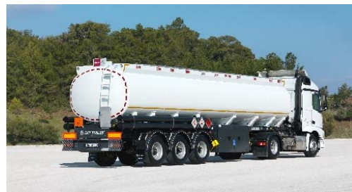
ELIPTICAL TANKER SEMI TRAILER