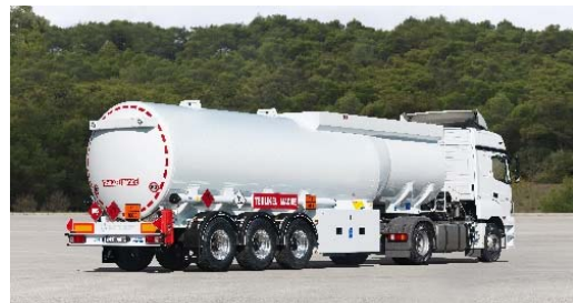
GOOSENECK TANKER SEMI TRAILER