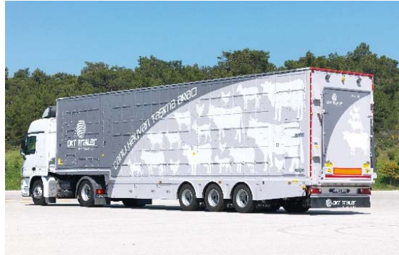
LIVESTOCK SEMI TRAILER