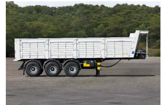
UNIVERSAL REAR TIPPING SEMI TRAILER