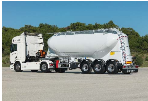
W TYPE NONTIPPING SILO SEMI TRAILER