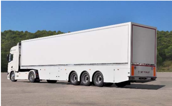
MOBILE THEATER SEMI TRAILER