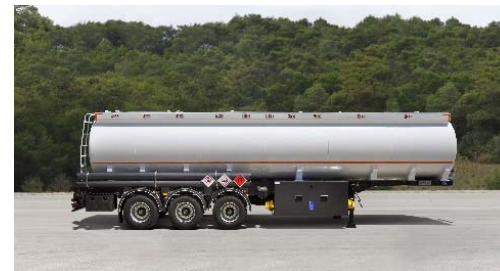
CYLINDRICAL TANKER SEMI TRAILER