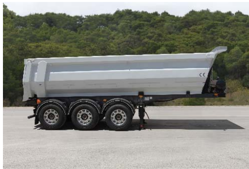
ROUNDED REAR TIPPER SEMI TRAILER