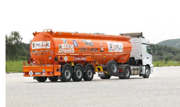
ROLLOVER TRAINING TANKER SEMI TRAILER