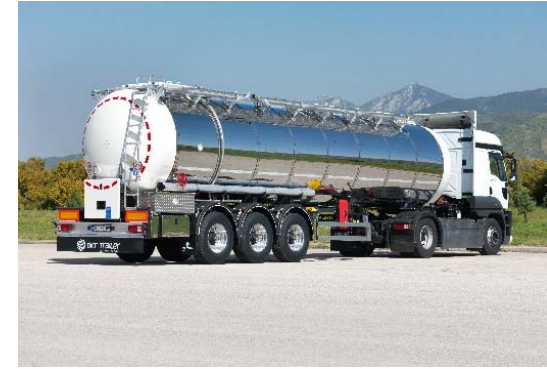
INSULATED TANKER SEMI TRAILER